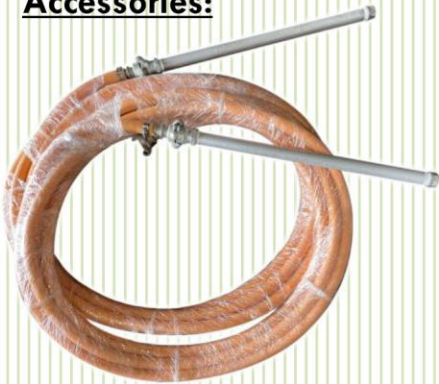
Delivery Hose with Gun