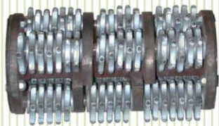
Drum Assembly (TCT include Holder)