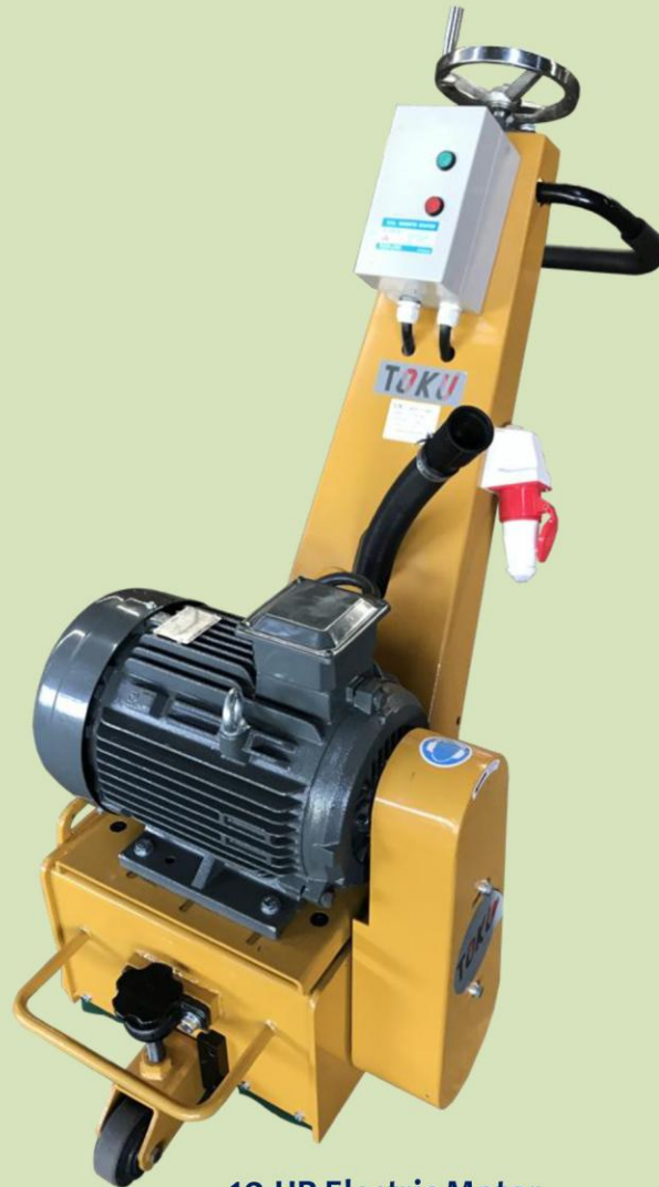
10 HP Electric Motor

The Scarifying Machine is the ideal choice for those seeking a compact, easy-to-use, long life and economical grinding machine. Used for floor preparation. Suitable for any surface and coating. Can performs mills surfaces on concrete and asphalt. Removing of traffic lines and also preparation for surfacing like cement, concrete and coatings.