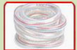
8M STEEL WIRE HOSE