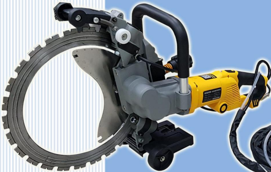
DIAMOND RING SAW