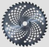
40T Brush Cutter Blade