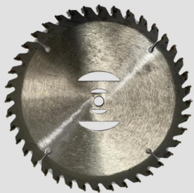
ALLOY BLADE SUITABLE FOR CUTTING BRANCHES AND BUSH