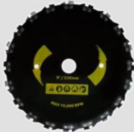
9" Brush Cutter Blade