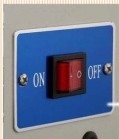
ONE-TOUCH SWITCH SIMPLE OPERATION MODE, FAST AND CONVENIENT. SAY GOODBYE TO CLUMBERSOME.