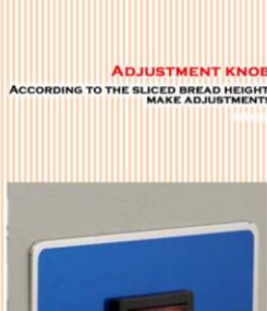
ADJUSTMENT KNOB ACCORDING TO THE SLICED BREAD HEIGHT, MAKE ADJUSTMENTS.