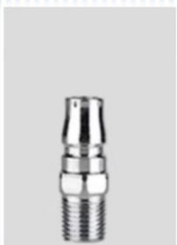
Air Inlet Connector